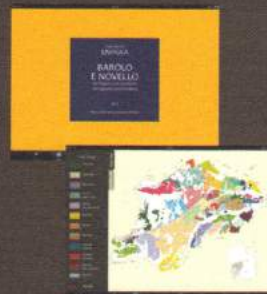
Enogea Wine Maps – Barolo