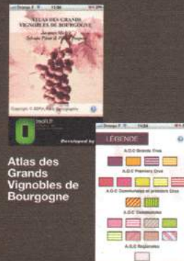
Atlas des Grands Vignobles de Bourgogne

Having that knowledge is especially helpful when it comes to food and wine pairings during white truffle season and Barolo pairings. "As they say, when it comes to pairing wine, what grows together goes together," Carlen says.